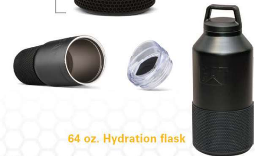
64 oz. Hydration flask