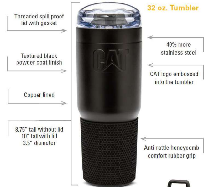
32 oz. Tumbler

Customize your Cat tumbler with your logo. Make sure your customers are keeping you in mind every time they grab a cold drink.